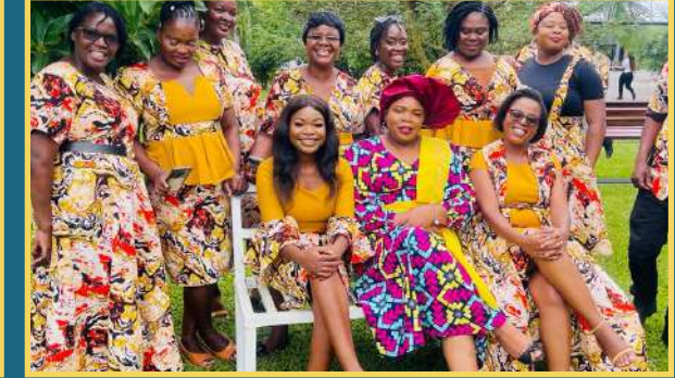
The CEO and NMCZ Ladies pose for a photo during women's day luncheon