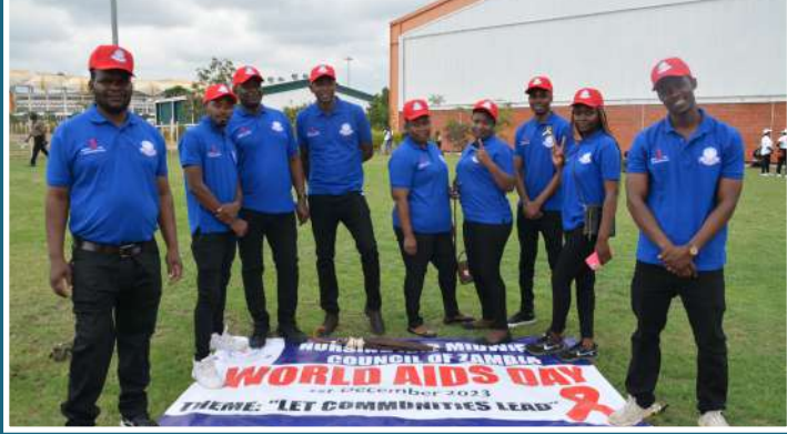
Recipients of the 2024 Labour Day awards