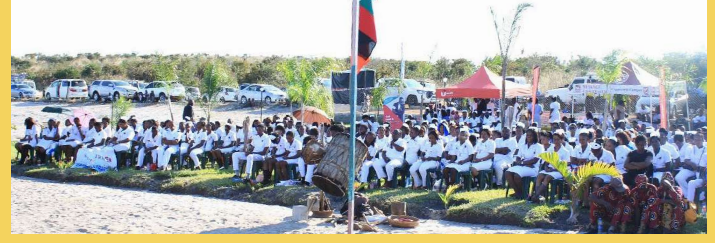
Nurses during the National Nurses Day commemorations in Samfya

This year's nurse's day was commemorated under the theme "Our nurses, Our future: the economic power of care".